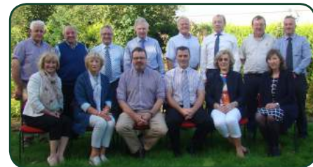
Coiste Eagraithe na Comhdhála Conference Organising Committee

members and towards this end names and contact details of support officers are included on page 6 of this newsletter. Where necessary a support officer will travel to your region to meet with you to discuss an issue of concern and provide advice and support.